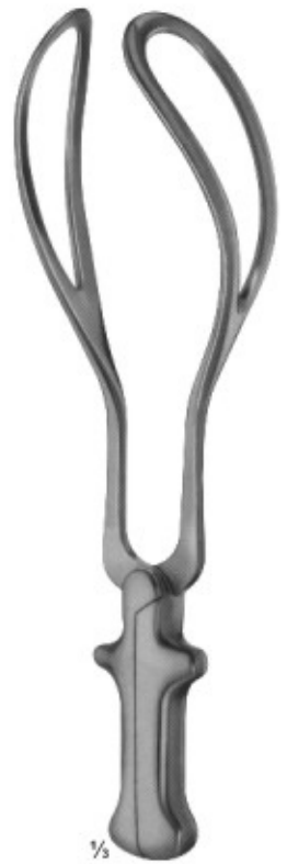
13-103 SIMPSON-BRAUN 305mm