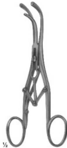
13-119 LABORDE 125 mm