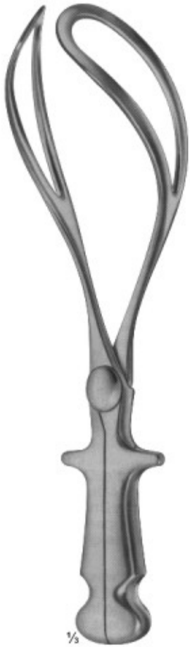
13-101 NAEGELE 355 mm