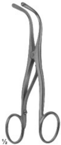
13-118 TROUSSEAU 120 mm