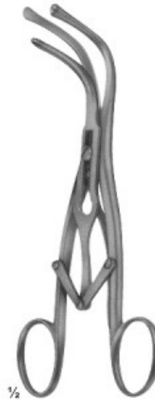
13-120 LABORDE strong pattern 135 mm