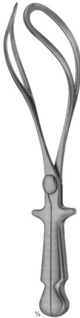
13-102 NAEGELE 400 mm