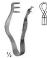
13-116 FINSEN 50 mm