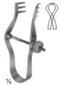
13-117 FINSEN 70 mm