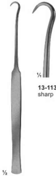
13-113 - 115 180 mm