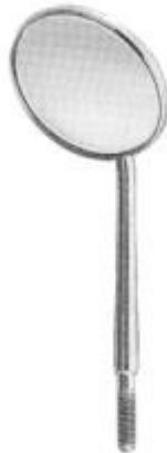
1920 Fig.5 ○ 24 mm