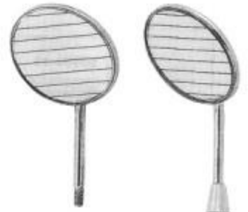
1916 Paraboloid mouth mirror