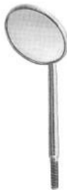
1921 Fig.4 ○ 22 mm