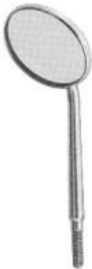
1919 Fig.4 Ø22 mm