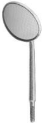
1918 Fig.5 Ø24 mm