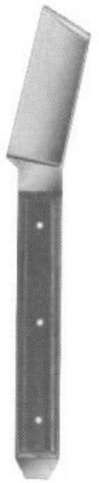
1703 17 cm, 6 3/4" Medicon