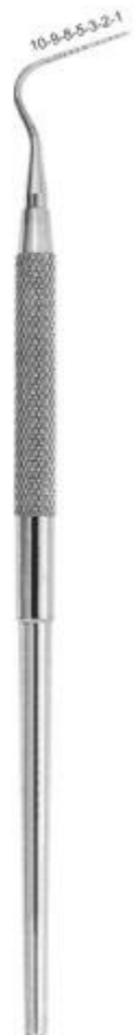
1506 26 G